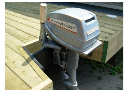
The transom option turns any NyDock pontoon dock into a pontoon boat

Want a swimming raft? Simply disconnect your dock from shore and tow it to your favorite swimming spot. Want a pontoon boat for fishing? Add a transom and you can fish anywhere on your lake – from the comfort of your own Muskoka chair!