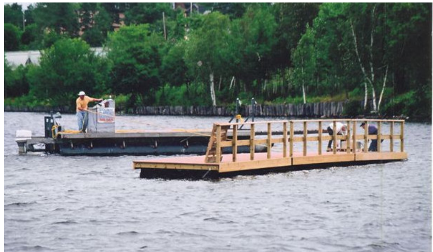
Installing a NyDock floating walkway using a NyDock pontoon boat as a work platform