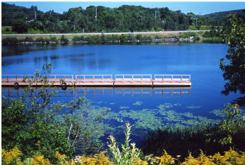
NyDock floating dock system as part of the Town of Huntsville's walking trail

At the heart of every NyDock system are pontoons made from the same tough, durable, HDPE pipe used in mining, municipal and industrial applications.