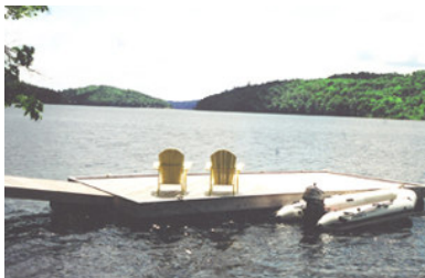
NyDock floating dock and access ramp

A NyDock system is a floating platform built for you - complete with pontoons, your choice of decking and cleats. You can add accessories such as bumpers, a swimming ladder, or a floating access ramp. You can even add a transom so that you can make your NyDock into a pontoon boat!