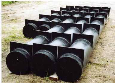
NyDock pontoons ready for installation

For the do-it-yourselfer, a NyDock kit is available. The NyDock kit includes everything but the decking. All that you have to do is assemble it - a perfect summertime project!